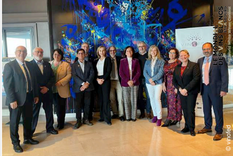
VINO FED General Assembly in Cannes, 2025